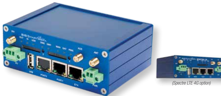
(Spectre LTE 4G option)