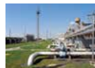
REFINERIES AND PIPELINES