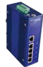
OFFSHORE OIL PLATFORM/RIG Industrial Isolated Serial Repeater Model# 4850PDRi-PH