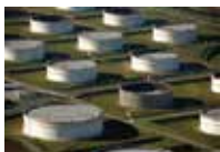
PETROLEUM PRODUCTS STORAGE