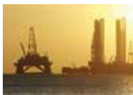
OIL AND NATURAL GAS EXPLORATION AND PRODUCTION

Advantech B+B supplies a complete line of highly secure connectivity solutions for controlling, monitoring and protecting systems in hazardous environments. Advantech B+B technology is found throughout legacy and modern energy generation and distribution systems and facilities.