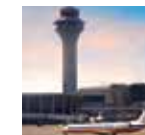
AIR TRAFFIC CONTROL