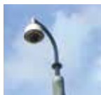
TRAFFIC CONTROL, LIGHTS & CAMERAS