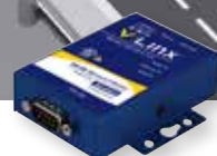
3 4 RAILROAD CROSSING SYSTEM & ROADSIDE SPEED RADAR Ethernet Mini Serial Server Model# VESP211