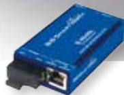
2 RED LIGHT CAMERA CONTROL Mini Copper-to-Fiber Converter (copper extension) Model# IE-MiniMc