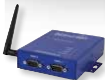
1 ROADSIDE DIGITAL SIGNAGE Industrial Wireless Ethernet Bridge Model# ABDN-ER-IN5018